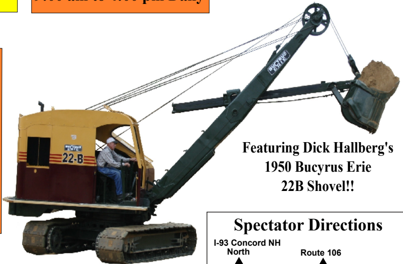
Featuring Dick Hallberg's 1950 Bucyrus Erie 22B Shovel!!

Come and watch as old construction equipment performs a variety of tasks including digging, dozing, grading, shoveling, hauling, the possibilities are endless!